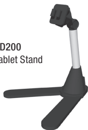
STAND200 10" Tablet Stand