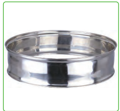
Extender Ring Attachment