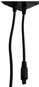
IR Receiver (on adapter housing)