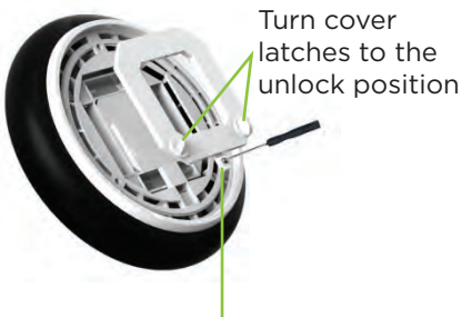
Unscrew Battery Cover