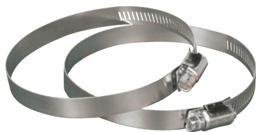
Metal worm drive clamps (available with A048MX/9 only)