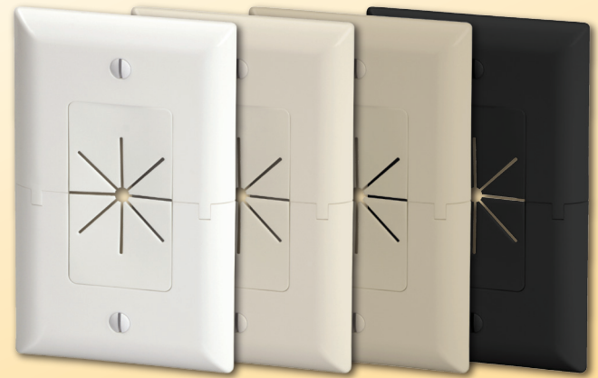
White Lite Almond Ivory Black

With the split design, this Cable Plate can be installed around existing low voltage cables run through the wall, eliminating the need to re-pull wires keeping the opening in the wall covered.