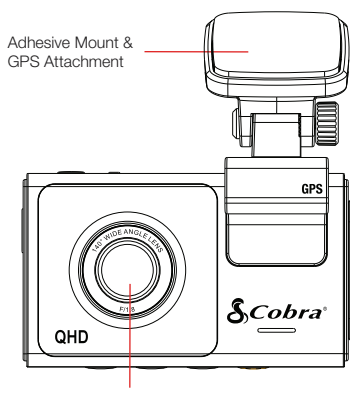
Front View Camera Lens