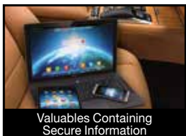
Valuables Containing Secure Information

Directed offers the most vehicle specific Harnesses.