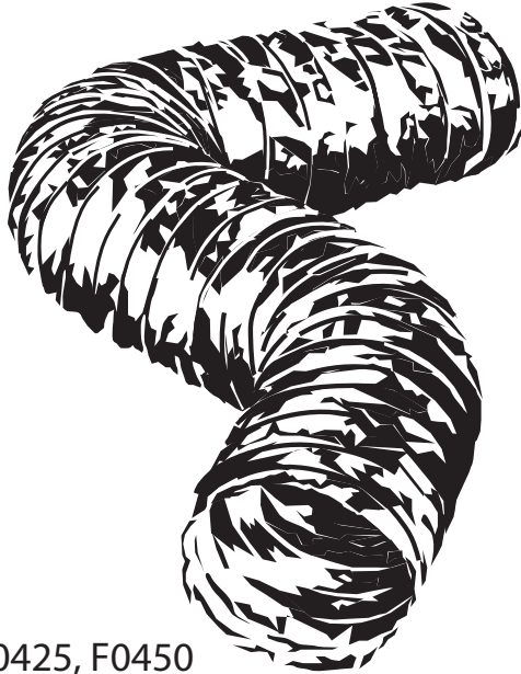
F0420B, F0425, F0450

Supurr-Flex® pure aluminum, multi-layered flexible metallic duct