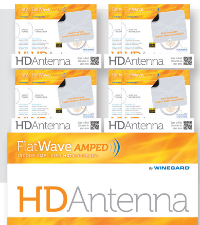
48 Pallet Pack