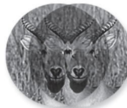
Single Circular Field