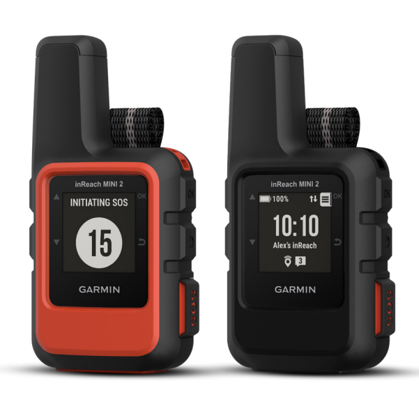
inReach Mini 2

Home is closer than you think with inReach Mini 2. This compact satellite communicator¹ adds peace of mind to your adventures without adding weight to your pack. Stay in touch globally with two-way communication and interactive SOS capabilities (active satellite subscription required). TracBack® routing navigates you back to your starting point the same way you came — right on your device. You can also share your location with loved ones back home by using your MapShare™ page or with your coordinates embedded in your messages. The digital compass delivers accurate heading information, even when you're not moving. Use the Garmin Explore™ app on a compatible smartphone to plan trips, access topographical maps, create waypoints and courses you can sync to your device, and more. Stay on adventures longer with up to 14 days of battery life in 10-minute tracking mode.