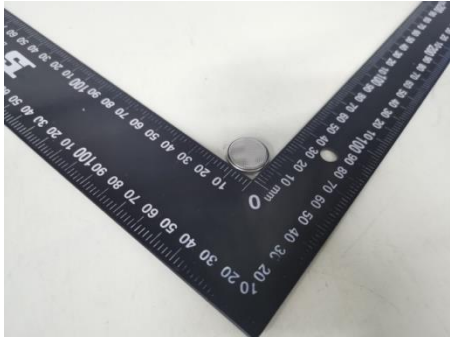
Cell/电芯 ( CR2032 3,0V 220mAh )