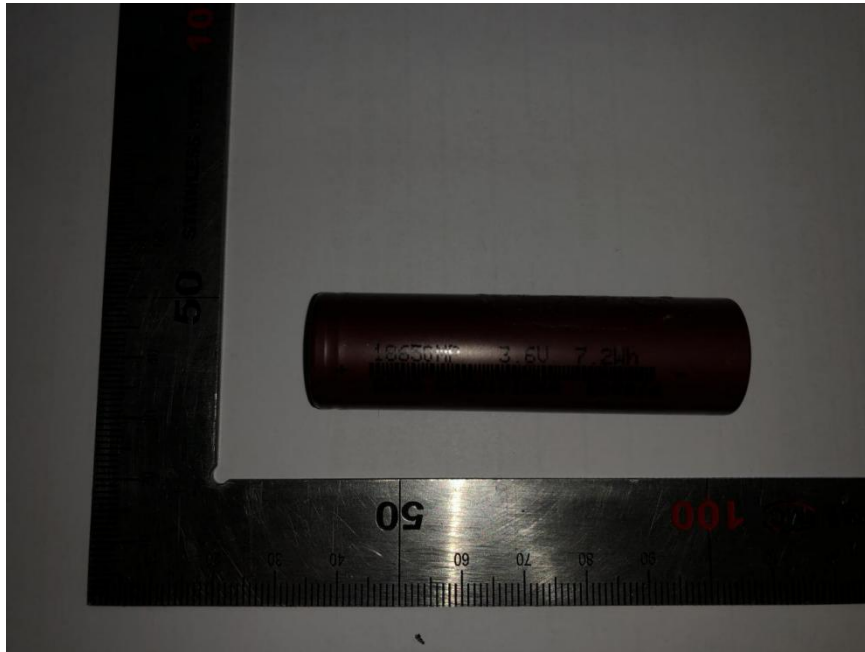
元件电池（正面） Component cell (top view)