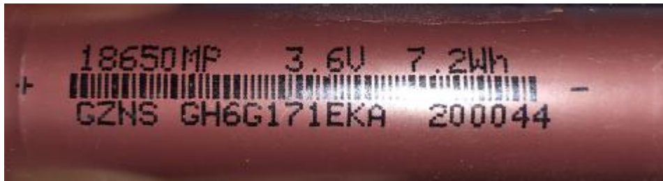
电池铭牌 Battery plate