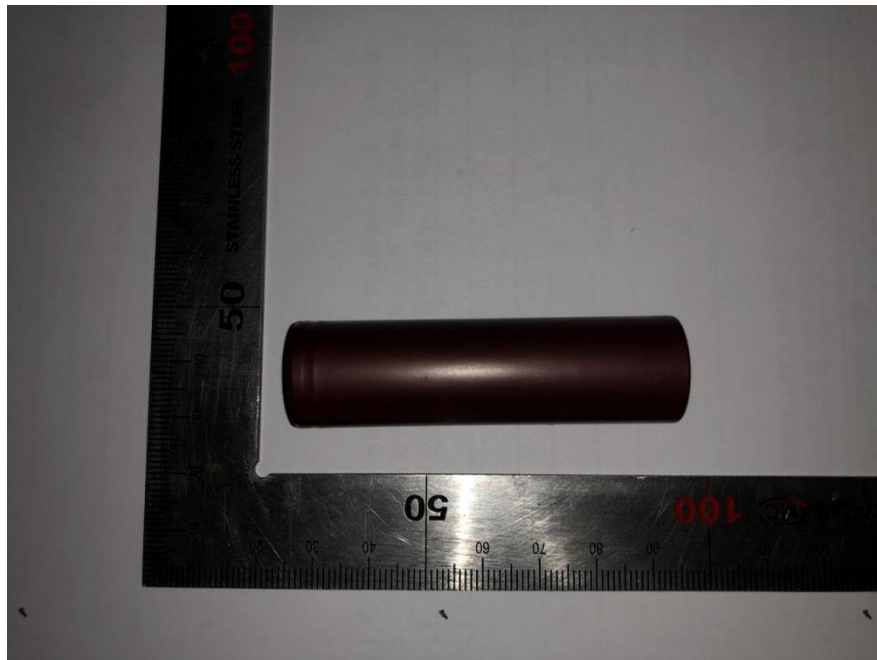
元件电池（背面） Component cell (back view)