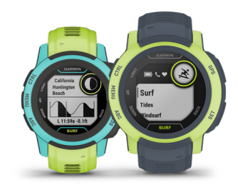
Instinct 2S, Instinct 2 Surf Editions