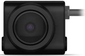
BC 50 010-M2609-00