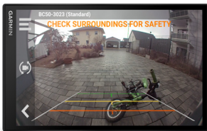
Garmin DriveSmart™ 66/76/86 series for every-day commuters

With a software update, BC 50 is compatible with a variety of Garmin navigation devices to help drivers of all vehicle types reverse with confidence. Visit Garmin.com/BC50 for a complete list of compatible devices.