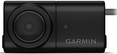
BC 50 with Night Vision 010-M2609-00