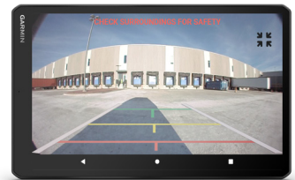
dezi® OTR610/710/810/1010 series for professional truck drivers