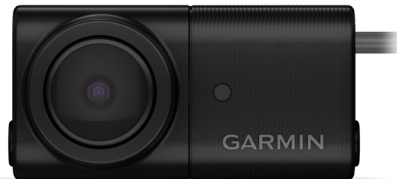
BC 50 with Night Vision