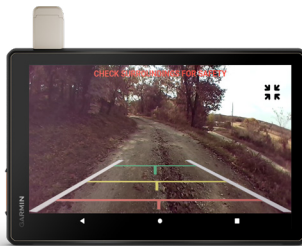
Tread® all-terrain series for off-roading or overlanding enthusiasts