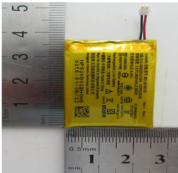
图1：正面 Figure 1: Front side