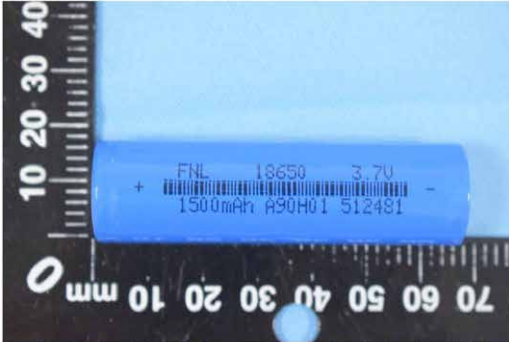
Photo 1 Front 正面