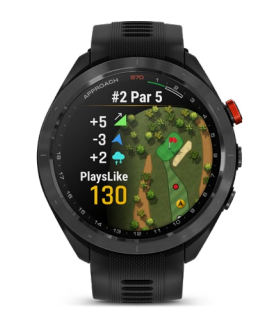
Approach S70 - 47 mm