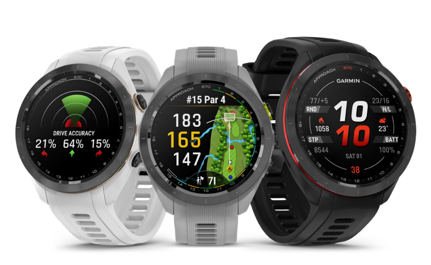
Approach S70 - 42 mm White and Powder Gray

If golf is your world, Approach S70 is your watch. Featuring a stunning AMOLED display, this premium smartwatch brings more than 43,000 courses to life and features all the on-course tools you need to lower your handicap. The improved virtual caddie feature provides a recommended club based on your shot dispersion data, elevation and more. An enhanced PlaysLike Distance feature utilizes a built-in barometer, so you'll know how far each shot is playing. And on your way to the hole, preloaded green contour data gives you insights into slope direction of the green (with an active Garmin Golf™ app membership). The slim, stylish design looks great on and off the course, with features that support your training — and lifestyle — including strength, yoga and running activities. Also get heart rate and advanced sleep monitoring for an extra edge when you're on the course¹.