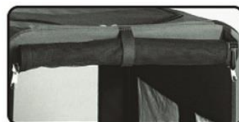
Door Open and Secured

If you have any problems with assembly or questions, please contact us via our e-mail: jespetausa@outlook.com .