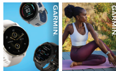
This is one panel with artwork shown on both sides.

This display is great for small spaces and should be used inside a glass case. It displays up to two Garmin dummy units on each tray kit. For larger product assortments, tray kits may be merchandised side by side. Use with dummy units, small product cards, common features product cards, brackets, graphic back panels and trays, all ordered separately.