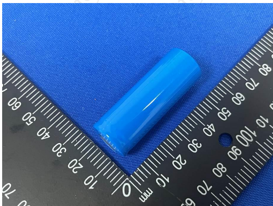
Picture 2. Cell view