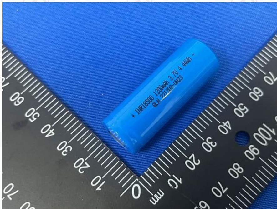
Picture 1. Cell view