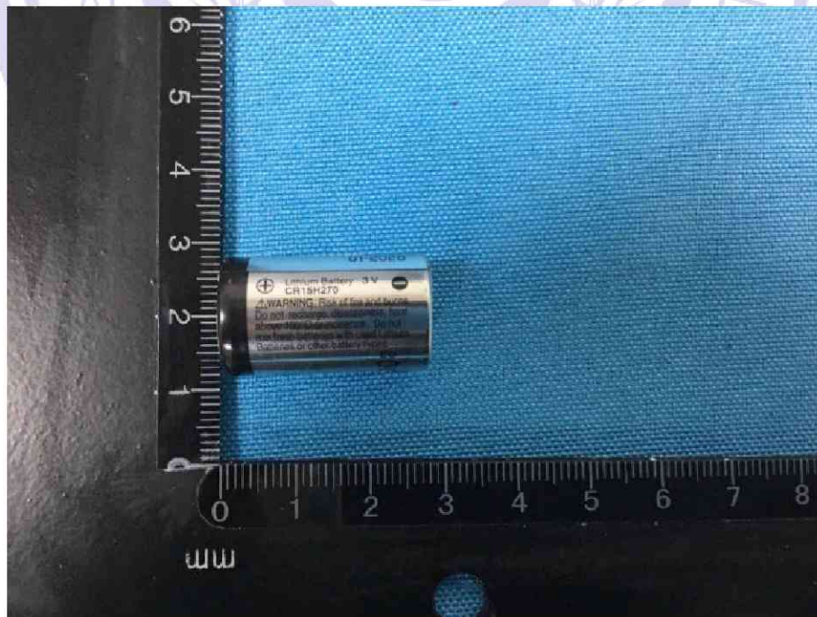
Photo 2 Rear 反面