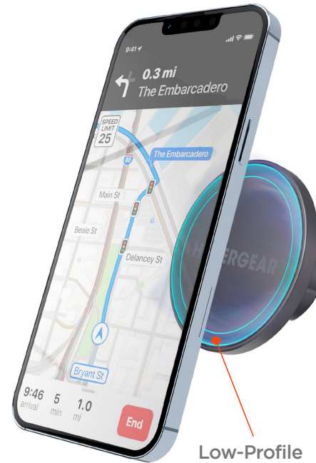
Low-Profile Magnetic Ring Mount