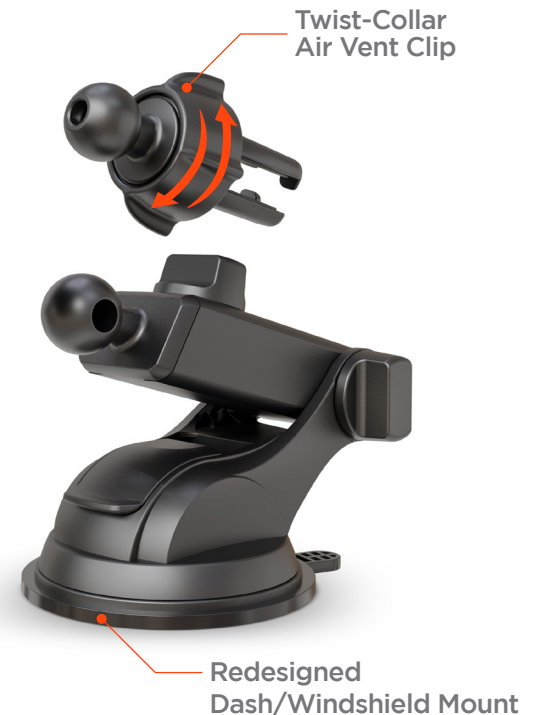
Twist-Collar Air Vent Clip