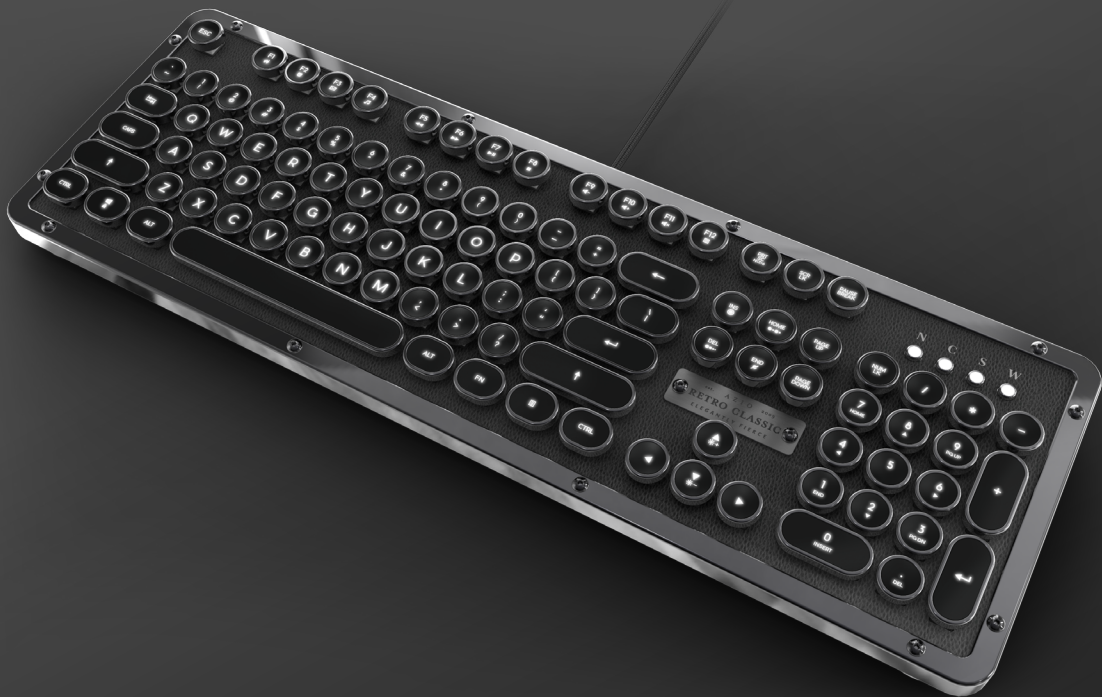
AZIO RETRO CLASSIC